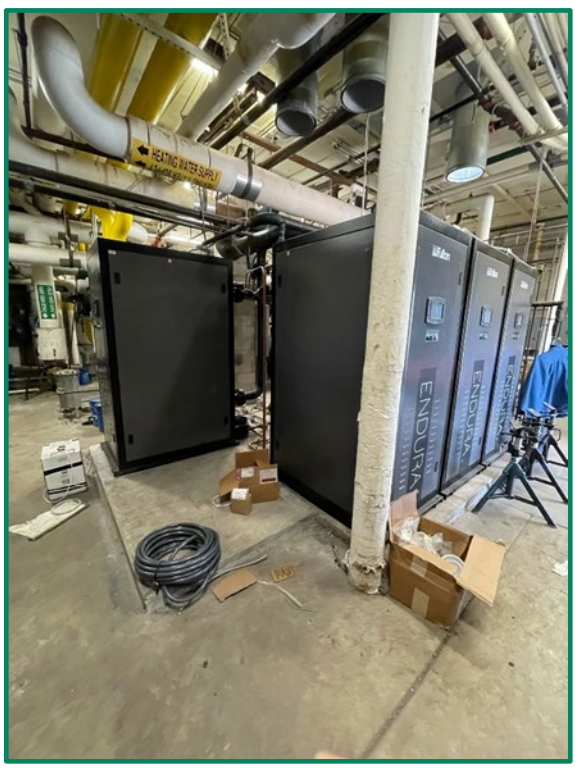
Hydronic Boiler Replacement for KHS