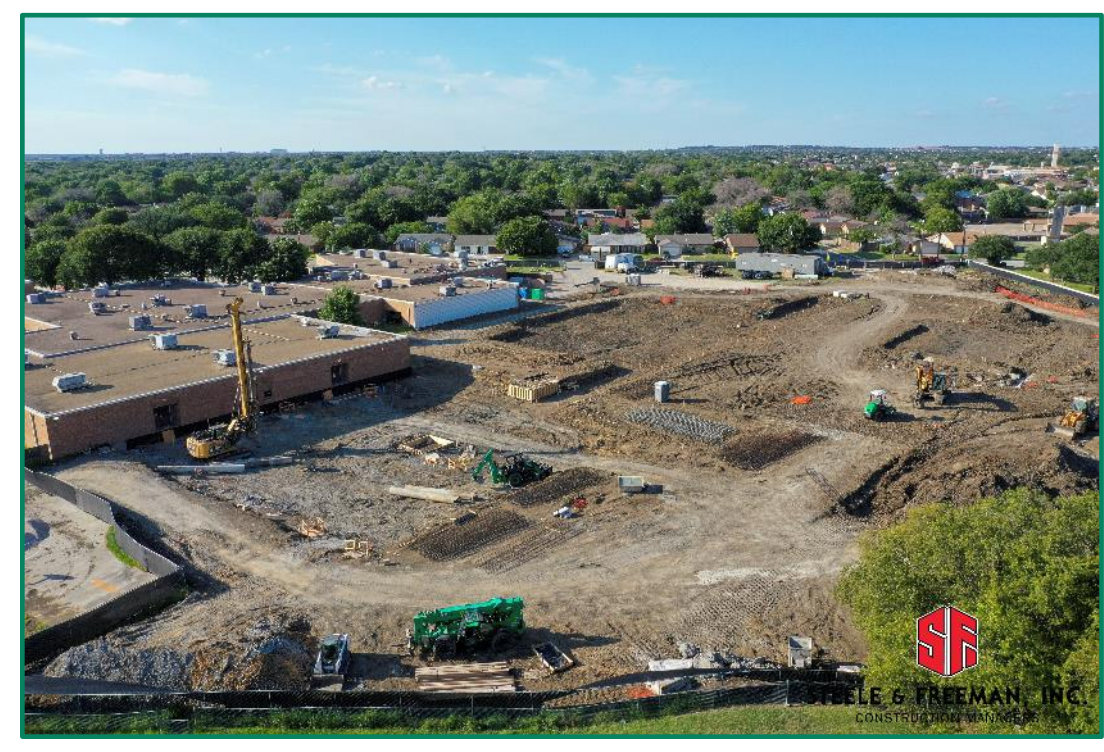
Pier drilling, site grading & temporary Fire Wall