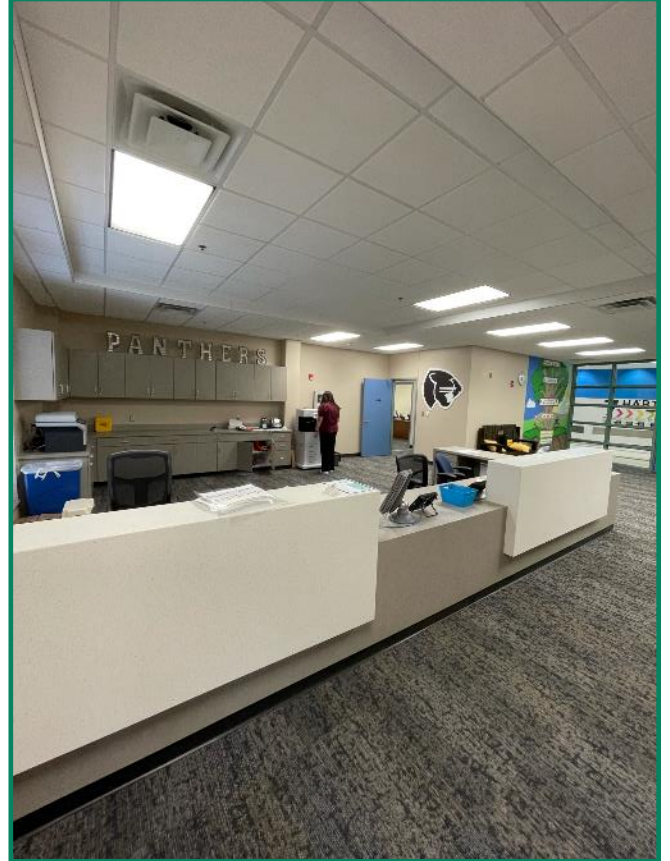
North Riverside ES