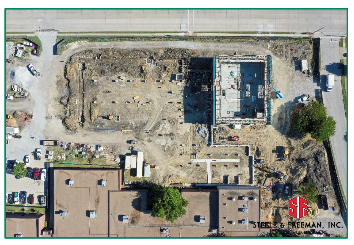
Storm Shelter Insulated Concrete Form (ICF) Progress