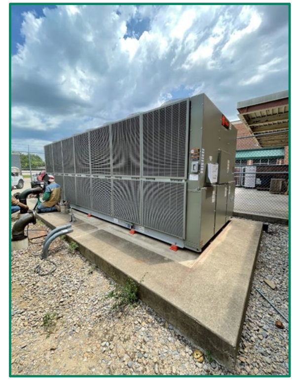
New Chiller for KCAL