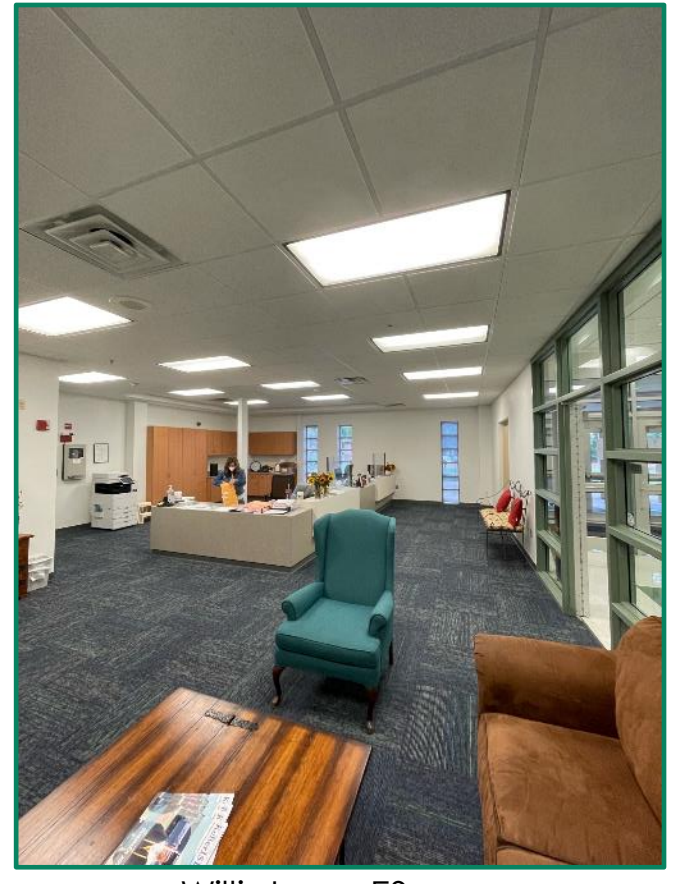
Willis Lane ES