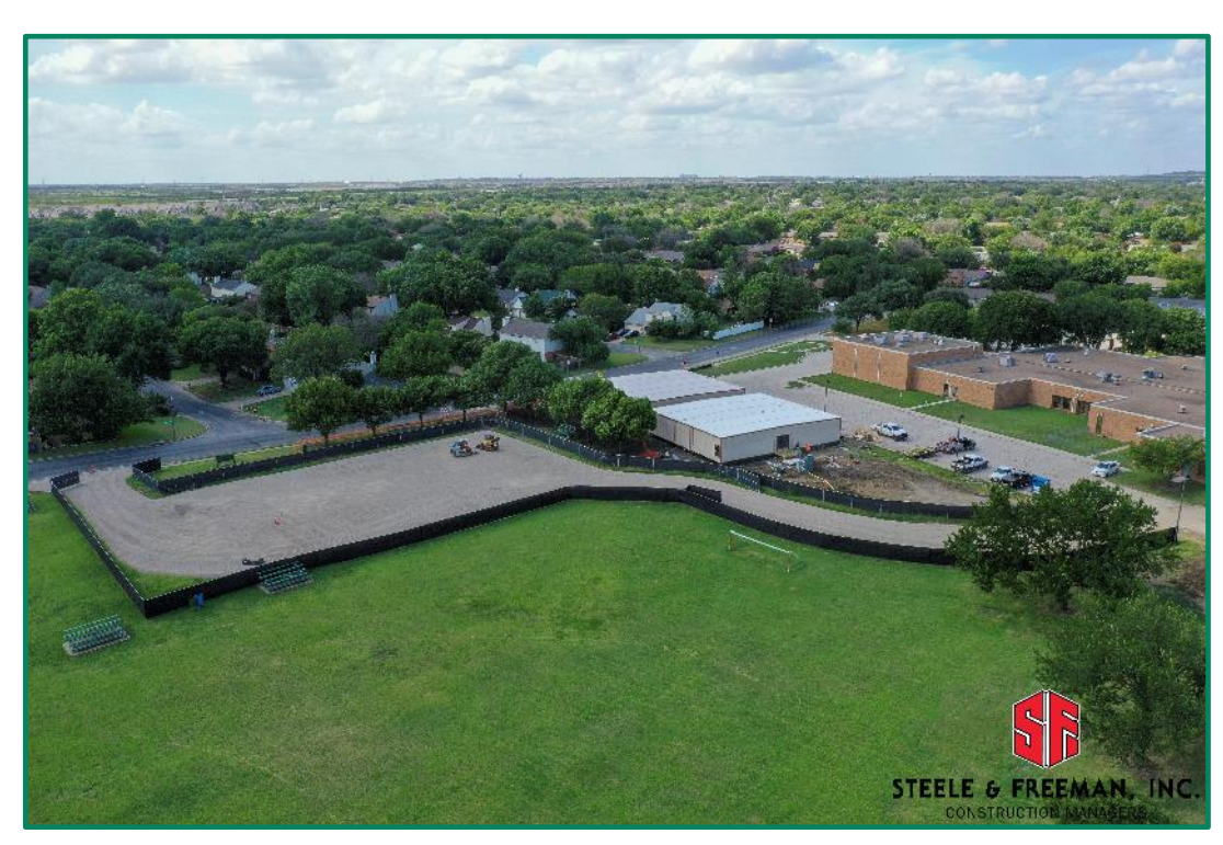
Temporary staff parking and bus loop

Site utility, pier drilling, grading, and portable connections are being made at Parkview ES. Temporary bus loop and staff parking lot is complete.